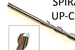
SPIRAL DRILLING UP-CUT ENDMILL

* The plunge value is for using the spiral drilling technique. Watch this video to learn how Watch Video