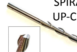
SPIRAL DRILLING UP-CUT ENDMILL

* The plunge value is for using the spiral drilling technique. Watch this video to learn how Watch Video