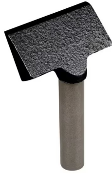
Nova 3" Tool Rest