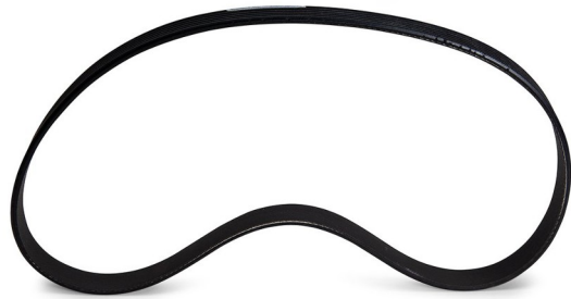
Nova Spare Lathe Belts (2)