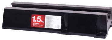
Nova 20" Extension (Black Shown mine is gray)