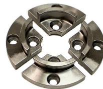
Nova Titan II Chuck with PowerGrip Jaws and 2" (50MM) Nova Jaws 1.25" X 8 TPI