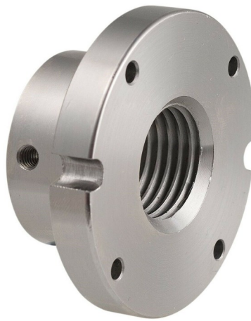
Nova 3" Face Plate 1.25" X 8 TPI