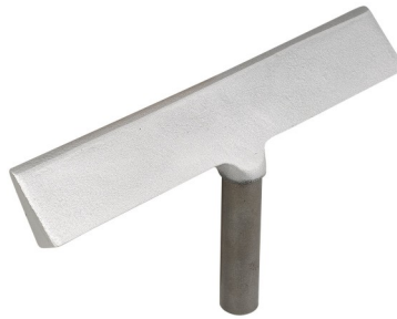
Nova 12" Tool Rest