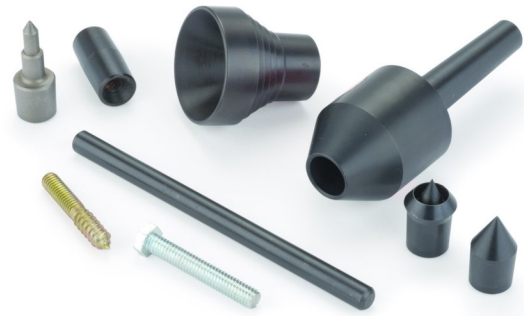
Nova Live Center System