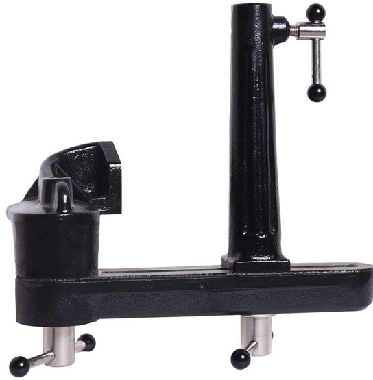
Nova Outboard Turning Outrigger (Picture is black but mine is gray)