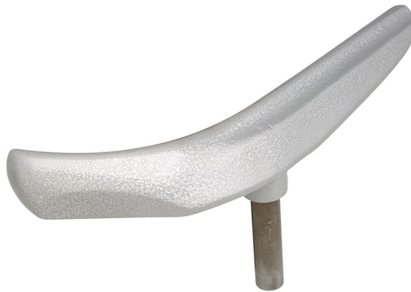
Nova 1" Post Windsurfer Tool Rest